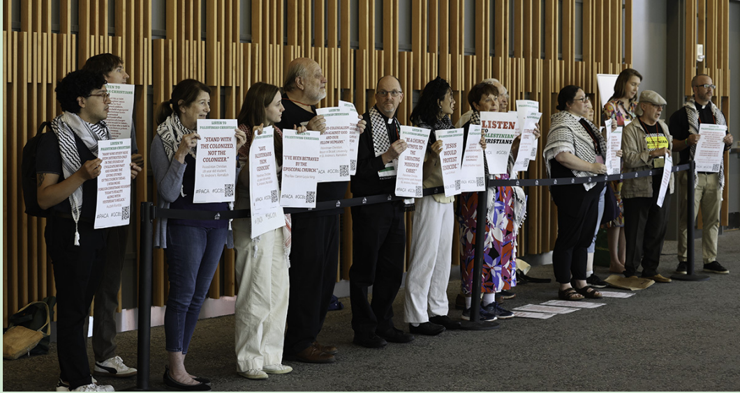
PACA & PIN action in House of Deputies: a silent witness on the floor & in the visitors gallery.