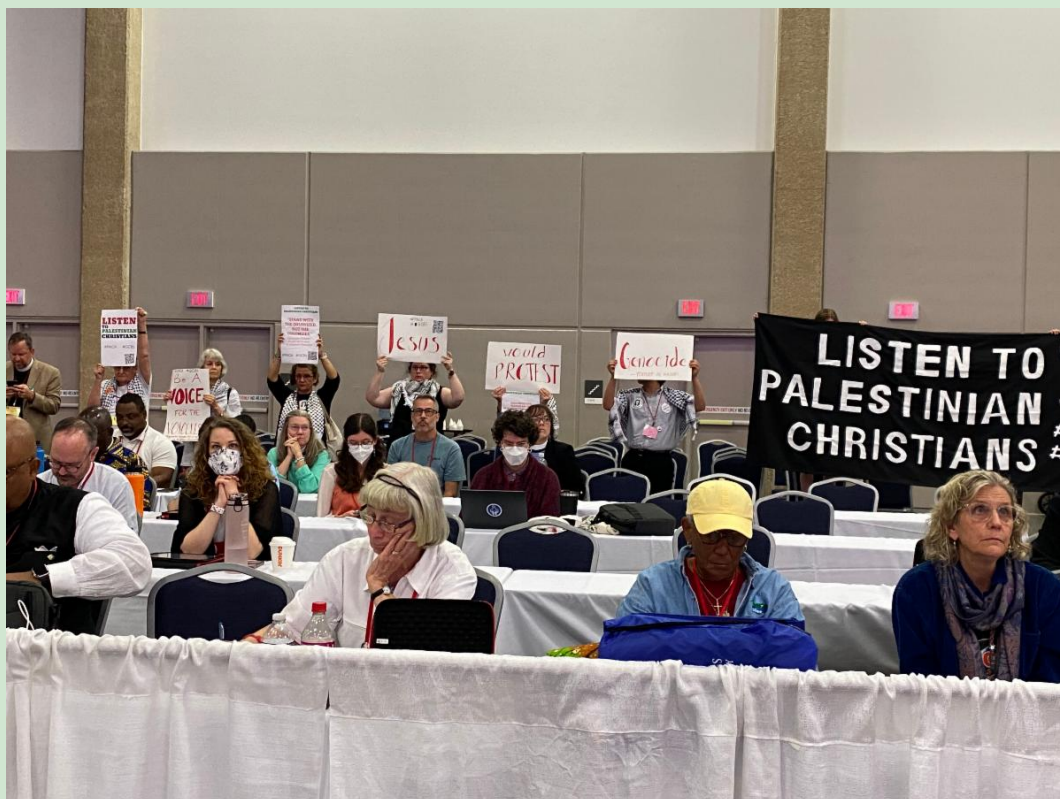
Protesters march from HOD to hallway to pray Compline for Palestine